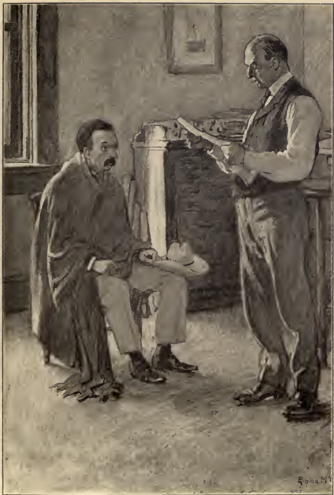
He looked like a conspirator in the play, or the assassin who lies in wait up the dark alley.